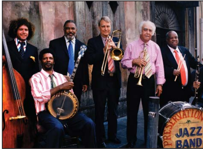
The Preservation Hall Jazz Band from New Orleans was among the performers during last season's Visiting Artist Series sponsored by the CPAC Inc.

Now in its 9th year, the organization had provided not only world-class talent to audiences, but educational opportunities for aspiring students. "I think the most